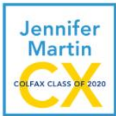
STYLE #5: CX COLOR: Navy, Light Blue, or White