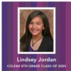
STYLE #3: PORTRAIT STRIPE COLOR: Blue, Green, or Purple