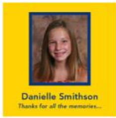
STYLE #1: Portrait Solid COLOR: Navy, White, or Gold