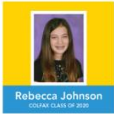
STYLE #2: PORTRAIT BAR COLOR: Light Blue, White, or Gold