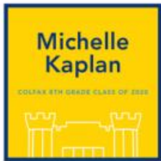
STYLE #4: BUILDING COLOR: Navy, Light Blue, or Gold